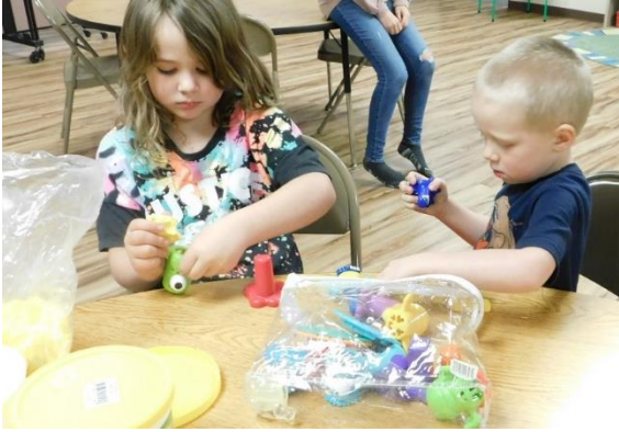
Play Dough Fun